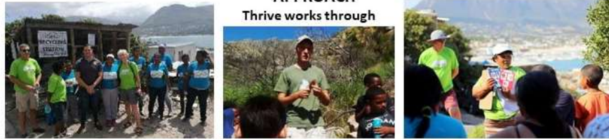
Volunteers and mentors